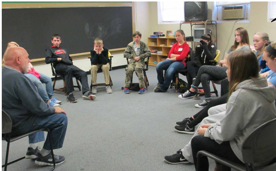
Twelve students from our Pastoral Region of St. Margaret Mary and Assumption participated in a retreat on March 11 as preparation for their Confirmation taking place on Thu., May 4 at 7 p.m. at St. Ann Church.